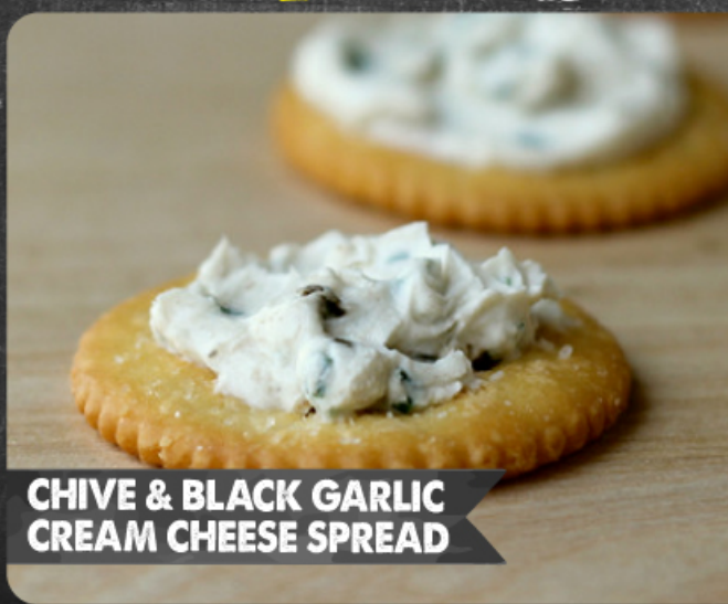
CHIVE & BLACK GARLIC CREAM CHEESE SPREAD