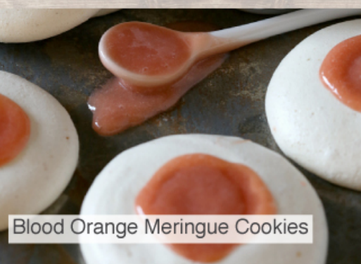
Blood Orange Meringue Cookies