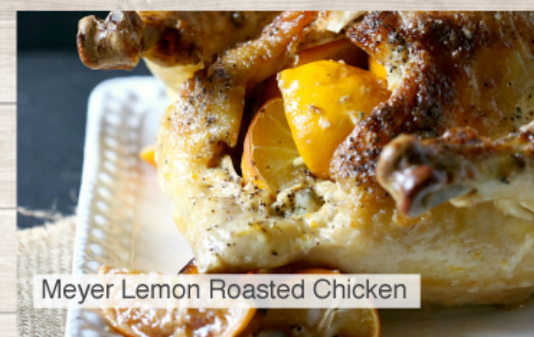
Meyer Lemon Roasted Chicken