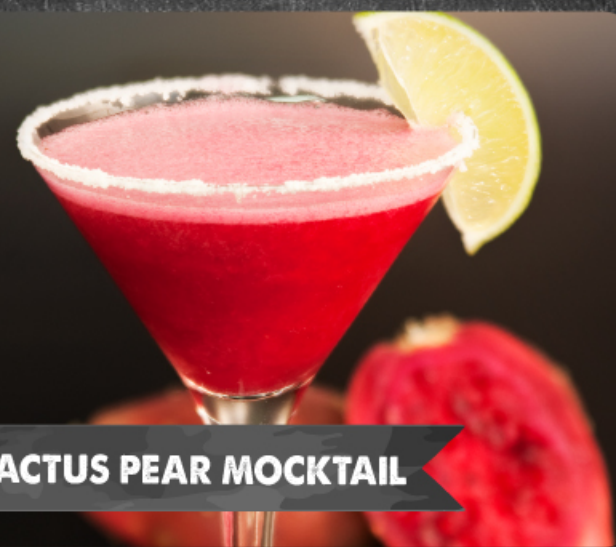
CACTUS PEAR MOCKTAIL